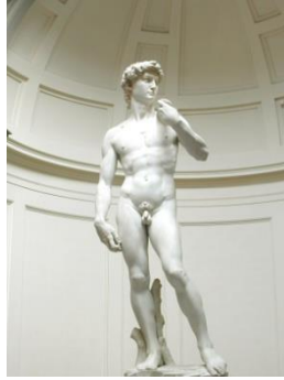
Fig 1: Michelangelo's David Sculpture. 39

Other problems have to do with the idea of taking Aristotle's hylomorphic compound ideas too seriously. It is also not clear whether there is a meaningful ontological difference between marble and the statue it comprises. There are certainly conceptual differences and, in the case of the pillar and statue example, functional ones, but any real differences beyond subject-bound perceptions of the material remain hazy. For instance, a farmer may view a pitch fork as a reliable instrument for pitching hay or other loose materials. A warrior may find the same instrument to be better suited as a weapon, valuable for thrusting into the fray. These conceptual perceptions with regard to the functional utility of the same instrument are not identical, nor would any thinking person believe so, but the instrument from which these conceptions were derived remains wholly identical to itself. But surely the theory intends to extend farther than the mere perceptual, though it still remains to be seen how such a task is possible, as even the examples portray human perception regarding a single unified molecular mass.